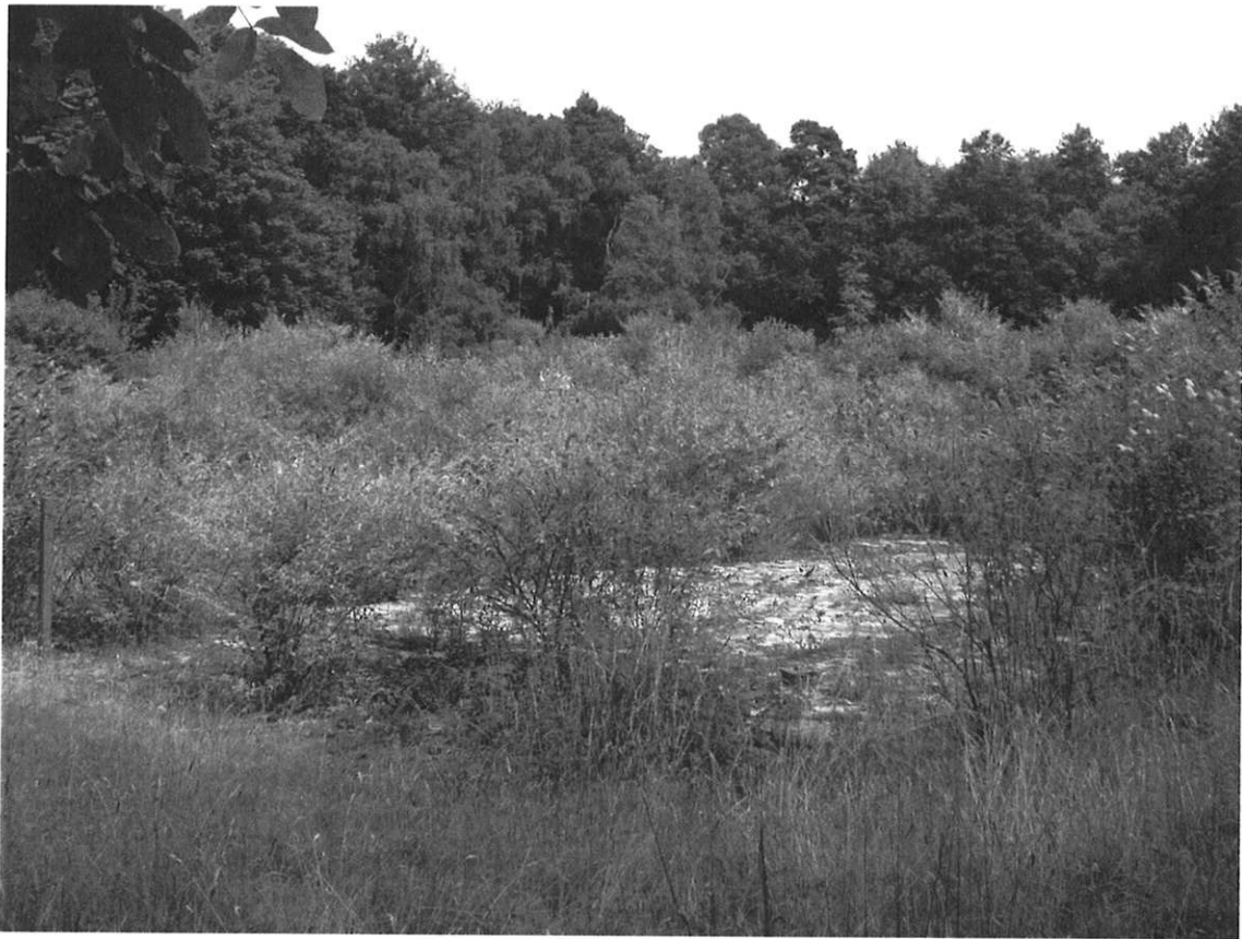
SU/15/0568 – FORMER CHESWYCKS SCHOOL, GUILDFORD ROAD, FRIMLEY GREEN