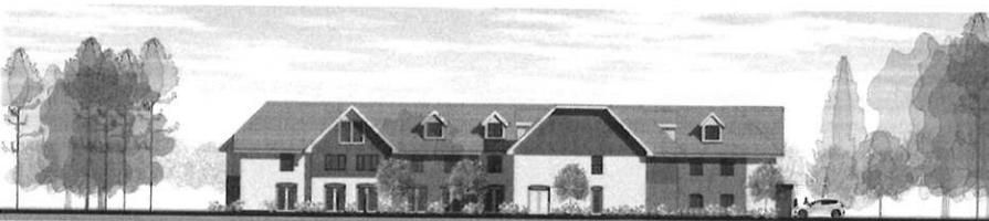
Elevation - South-West

THIS DOCUMENT IS THE PROPERTY OF THE ARCHITECT AND IS NOT TO BE REPRODUCED OR TRANSMITTED IN ANY FORM OR BY ANY MEANS, ELECTRONIC OR MECHANICAL, INCLUDING PHOTOCOPYING, RECORDING, OR BY ANY INFORMATION STORAGE AND RETRIEVAL SYSTEM, WITHOUT THE WRITTEN PERMISSION OF THE ARCHITECT. Rev. Date Description 1 10/2014 Issue for tender 2 03/2015 Revised drawings to reflect PCN & LPS 3 09/2014 Revised drawings