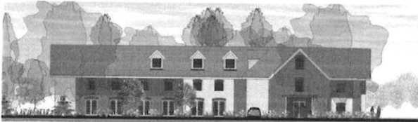
Elevation - South-East