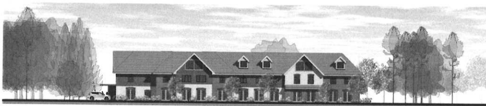
Elevation - North-East