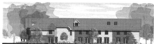
Elevation - North-West